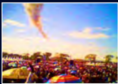
Before GOD'S CLOUD touched the Revival Meeting: Dec 31st, 2012

Since the days of Adam and Eve, the world has become infamous as a place for a detestable form of heedlessness to the living word of God. This level of blatant lawlessness is what had earlier caused Adam and Eve to be cast out of the Garden in Paradise, and thrown farthest from the tree of life, in the most disgraceful manner ever. If humanity were to count her losses, then the towering truth of what she lost in that fall, can cause her to stagger, stumble and fall. In HIS original plan, the LORD had intended that no death be factored into the equation that defined man's life. Death and decay were not found there! All these pleasantries that the LORD advanced towards mankind at Eden, were based on the assumption that Adam and Eve would observe a faithful worship of righteousness. This worship of obedience is what had earlier on earned Adam and Eve an adorable first phase of their life in the garden, a phase in which