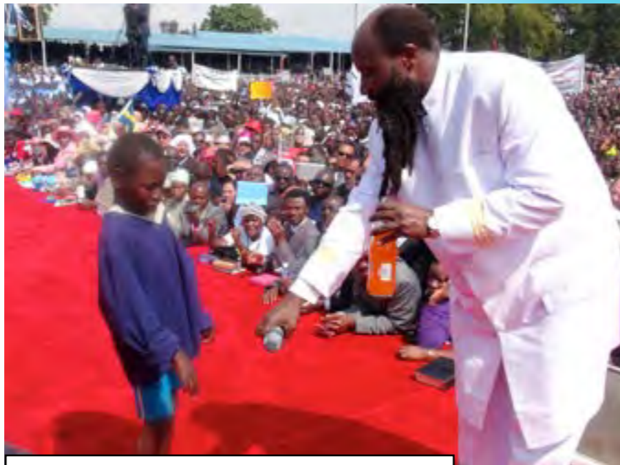
KAKAMEGA REVIVAL DEC 31, 2013 - JAN 1, 2014: And The Lord Shockingly Stretched Shriveled Hands

of Israel. The LORD OF HOSTS had to bring healing and deliverance to Israel at Marah , that she may prepare herself for the grand entry into the land of super plenty, Elim . At Elim , the LORD unleashes HIS abundant and plentiful supplies .