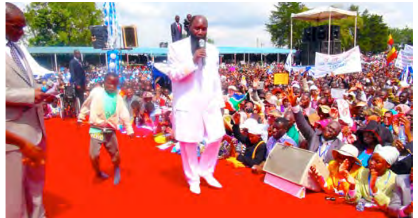
GRAND MEGA REVIVAL, KAKAMEGA KENYA / DEC 31, 2013 - JAN 1, 2014

It is this walk with God that the original apostasy in the garden eroded from the inscriptions that defined man's life on this earth. That is how death was finally factored into the equation that describes man's life here on earth. And as if to prove HIS original beautiful disposition of love towards the church, God Almighty then found the faithfulness of Enoch to be befitting of HIS communion. And