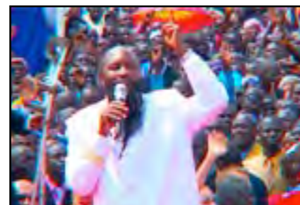
GRAND MEGA REVIVAL, KAKAMEGA KENYA / DEC 31, 2013 - JAN 1, 2014:

At this meeting of the LORD, a historic number of cripples got up and began to walk all over the stadium.