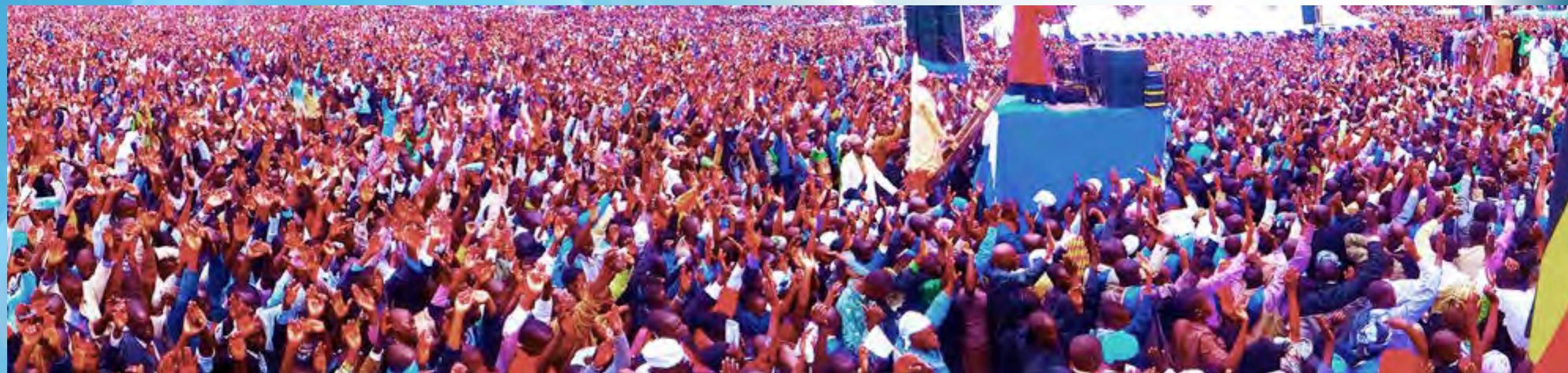
KAKAMEGA REVIVAL / DEC 31, 2013 - JAN 1, 2014

It is the Mt. Sinai encounter that highlighted the need for Israel to correct her past life by faithfully walking with GOD. This would require that the Israelites embrace the Word of God in their hearts, at all times, and for all the days of their lives. And as we have seen, when the LORD did that, HE principally implied that HE was longing to walk with man again, as HE did in the garden with Adam prior to the fall. It also became the greatest indicator yet, that in the near future, HE would send HIS One and ONLY begotten Son to come down to the earth and dwell among men and walk with them. This is HE whose name is the Word , and that whosoever would receive HIM and walk with HIM for all the days of their lives, would never perish but see eternal life . This is why HE THE LORD JESUS came in the name EMMANUEL which means, GOD walking with man . JEHOVAH knew that by walking with Jesus all the time, it would primarily require that Jesus live in the